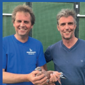
Gebroeders Desbuquois (BE)

1° National Section Argenton 7061 Young Birds 2016